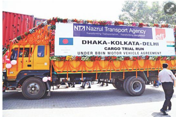
A Bangladeshi truck reaches India under BBIN Motor Vehicle Agreement.

The truck of Nazrul Transport Agency and Expo Freight Pvt Ltd from Bangladesh left Dhaka on August 27 and reached the Inland Customs Depot in east Delhi yesterday morning.